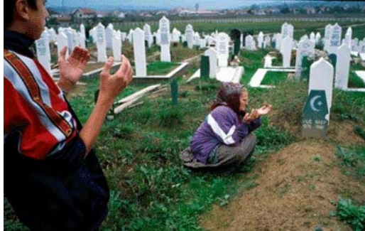
A Muslim woman grieves at the grave of her husband. Many women still do not know the exact fate of loved ones who have been missing for years.

ince. Kosovar Albanian paramilitary groups clashed with Serb forces, and amidst accusations of terrorism, drug trafficking and ethnic cleansing on both sides,