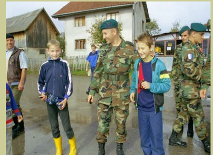
Turkish soldiers visit the village of Budozelje during a 'presence patrol'. NATO units perform a range of missions in Bosnia and Herzegovina to maintain a safe and secure environment.