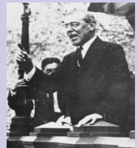
President Wilson's dream of a League of Nations was never achieved. The U.S. Congress voted against joining, and the Allied powers subverted Wilson's plans by forcing huge reparations on Germany, sowing the seeds for World War II.

FIND OUT MORE: Research the following regions and identify the source of conflict over national identity: Northern Ireland (Great Britain), Quebec (Canada), Chechnya (Russia), the Basque region (Spain), the Kurds (Turkey, Iraq and Syria).