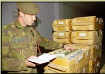
Inspecting weapons storage facilities is a typical mission for NATO peacekeepers.

Another type of mission I run is a weapons storage site inspection. Each militia is allowed to have so many types of weapons and allowed to train only so often. It is our job to enforce these requirements... The day of the mission, my platoon drives to the site, sets up security of the area, and I go and meet with the site commander. Some sites