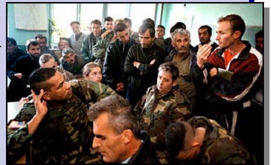
NATO peacekeepers hold ‘town meetings’ with local Kosovars to discuss important issues of reconstruction.

Troops from over 30 NATO and non-NATO countries have participated. KFOR provides the ‘muscle’ for other international organizations, like the UN, who play a large part in the political development of Kosovo’s new government. Kosovo has a very unique status; it is still technically part of Serbia but it is run almost exclusively by the UN authorities, who have not pushed to make Kosovo an independent nation. Maintaining a stable environment in Kosovo has important repercussions in neighboring regions like Macedonia and Albania.