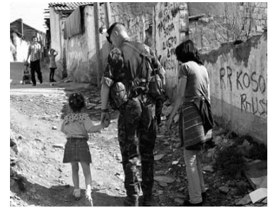
The wars in Yugoslavia forced NATO to adapt to a new reality in Europe.

NATO (the North Atlantic Treaty Organization) was originally formed as a defensive alliance between the U.S., Canada and western European nations committed to protecting its members from attack by the Soviet Union. Getting involved in operations in Yugoslavia signaled a big change for NATO and for European-American relations.