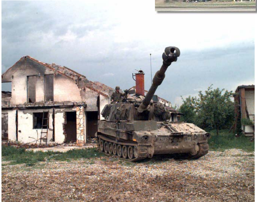
Political tensions between the republics of Yugoslavia led to the outbreak of war in the 1990's.

communist government, and although not as ethnically unified as Slovenia, this relatively wealthy republic also began to actively call for a separation from federal Yugoslavia.